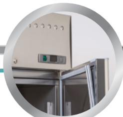
Uitneembaar deurrubber replaceable door gasket