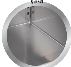
Afgeronde hoeken rounded corners