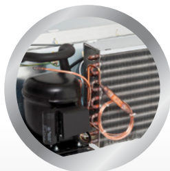
Monobloc koelsysteem removable compact refrigerating unit